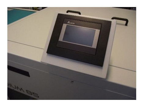
Full Colour LCD Touch Screen HMI Display provides access to all control functions and displays all processing parameters